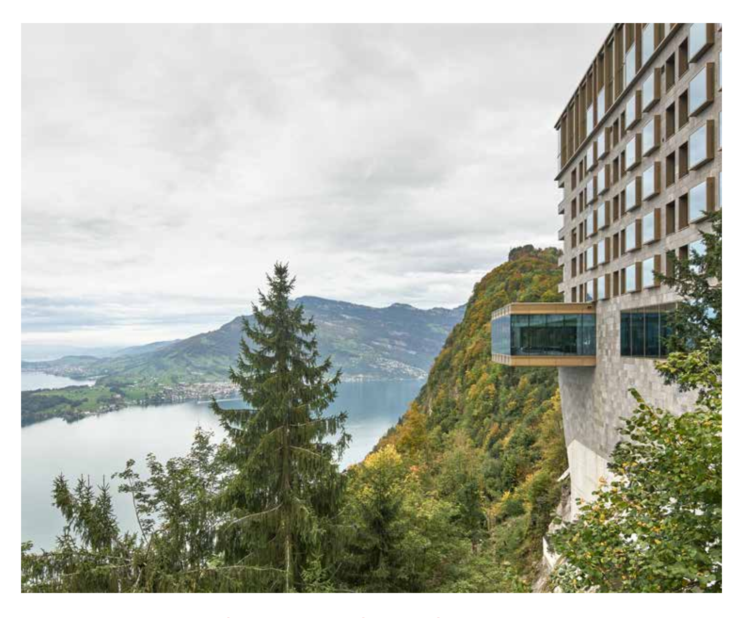
Elevator products and packages Hotels